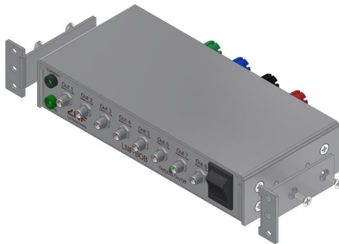
Figure 6 Attaching mounting flanges to LNF-BOB

When it is used as bench top instrument it needs to be put on flat surface to ensure that it stands stably. In the case when it is used as 10" sub-rack, the mounting flanges shall be attached to the enclosure (see Figure 6). One pair of mounting flanges and four M4x12 screws are included.