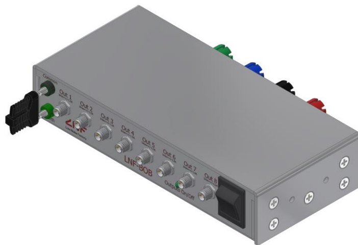
Figure 8 LNF-BOB –Plugging the Common (GND) to Earth (PE)

In some situations, it can be necessary to have Common (GND) connected to Earth (PE), or in other words to not have your system floating. The jumper plug shown in Figure 4 is used for that purpose.