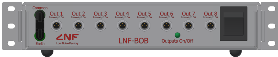
Figure 1 LNF-BOB Front Panel

The LNF-BOB has connectors on both front and rear panel. Figure 1 and Figure 2 are showing them: