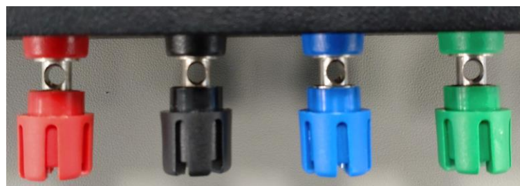
Figure 7 LNF-BOB Rear Plane - Binding Post Connectors