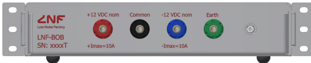
Figure 2 LNF-BOB Rear Panel