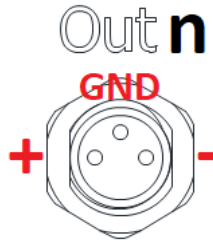
Figure 3 Out connector pinout - front view

The front panel is equipped with eight M8 3-position connectors (manufacturer part number: T4040034031-000) for connecting LNF-PS3b, LNF-PS4 and LNF-PS8. The pinout is shown in Figure 3.